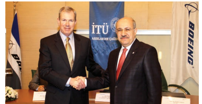
Boeing, Istanbul Technical University Launch Collaboration in Aerospace Technology Research, 2013