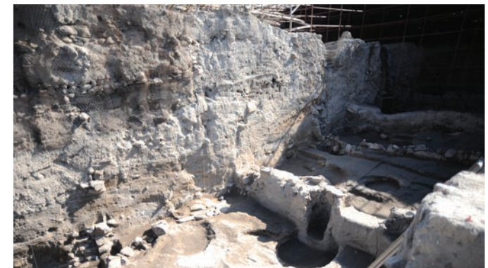
Excavations in Kaman Kalehoyuk, 2011