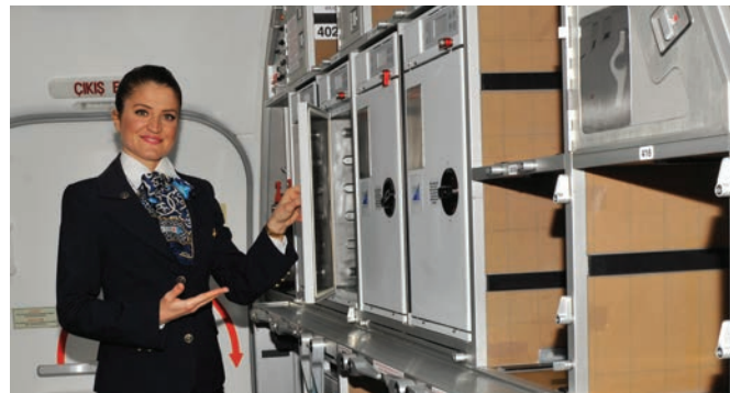
Turkish Airlines takes the delivery of the first airplane from Boeing, featuring galleys from Turkish Cabin Interiors, 2014