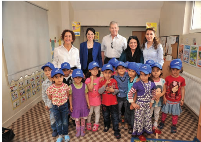
ACEV's (Mother Child Education Foundation) Alipasa Early Learning Center in Diyarbakir, 2014