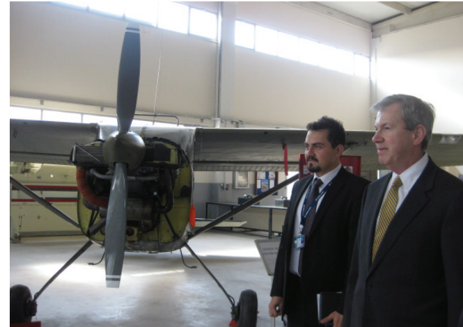
Boeing Launches Program With Ege Higher Vocational School in Izmir, 2013