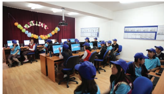
Computer lab established at Huriye Askar Primary School in Afyonkarahisar, 2012