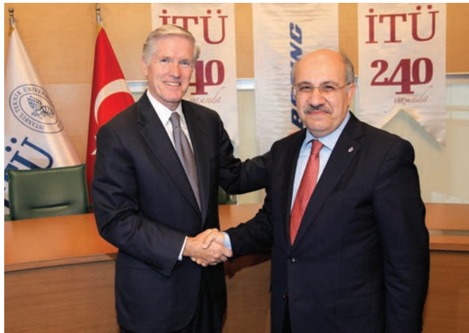
Boeing, Istanbul Technical University Launch Scholarship Programs for Students and Faculty, 2013