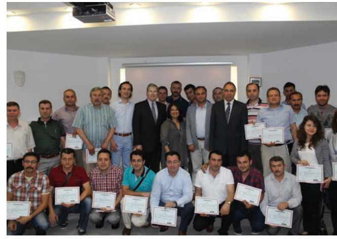
Boeing and Anadolu University Complete Second Phase of Aircraft Maintenance Training Program, 2014