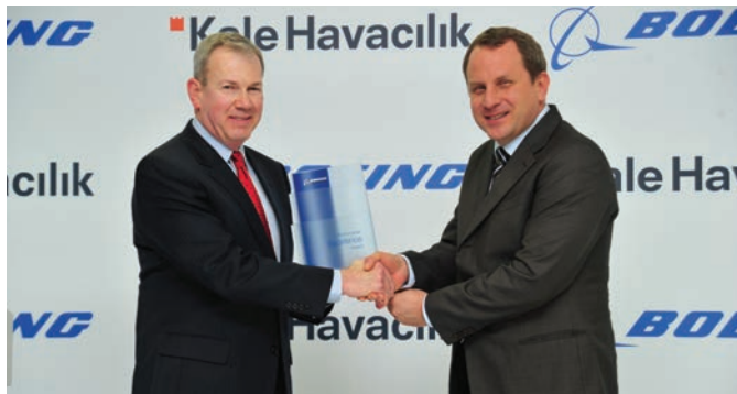
Kale Aero receives Boeing Performance Excellence Award for 2012.

* Oxford Economics Research for Boeing, August 2013.